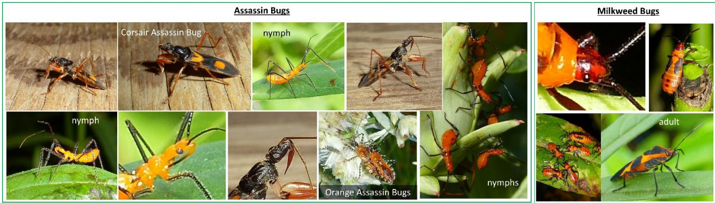
whereas the head of an Assassin bug is on a narrow neck (head and neck are about 1/8-3/16" long combined and the head can swivel). Assassin bug nymphs often appear to have a 'sway back' like an old broken down horse and in the case

with a close up of their heads. Notice that the head of the Milkweed bug is attached directly to the body and is somewhat triangular,